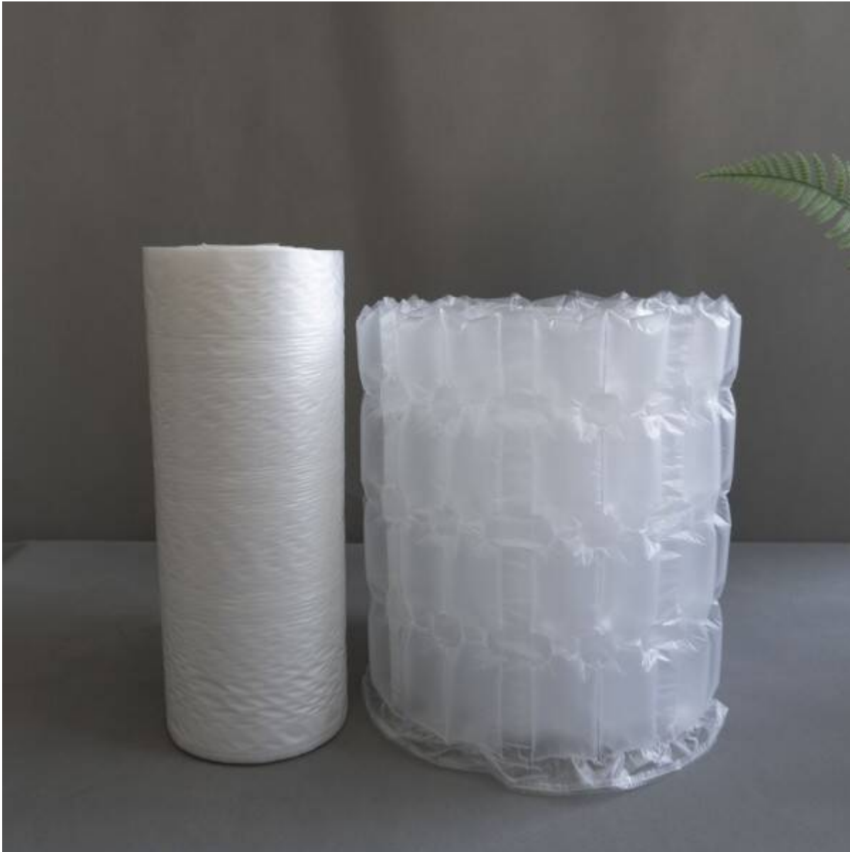
Air Pillow film Tube Wrap Roll