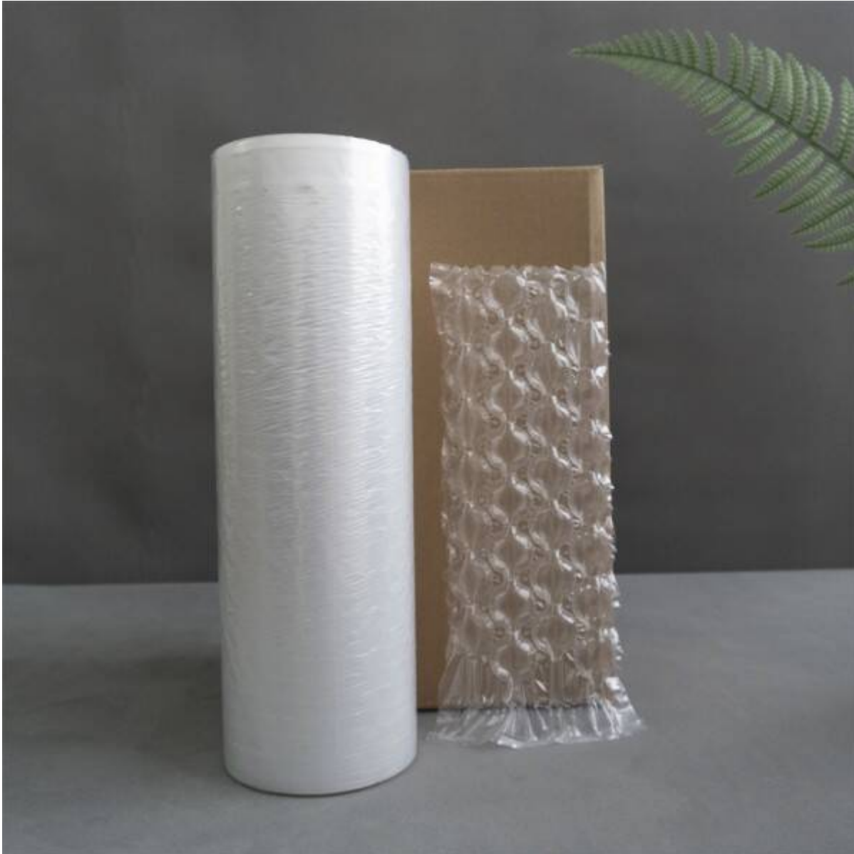
PAPE Air Bubble Pillow Film