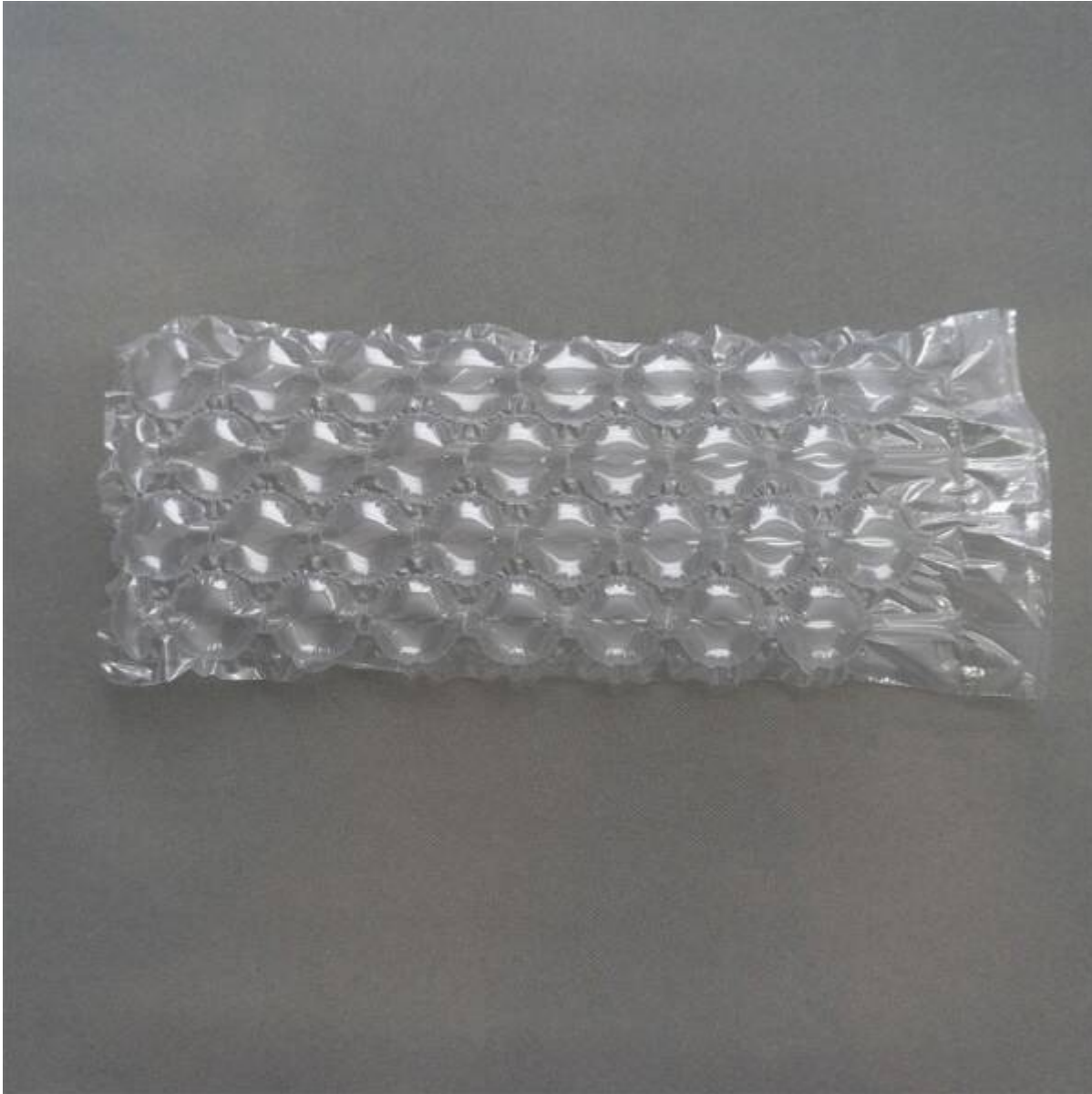
PAPE Air Bubble Pillow Film