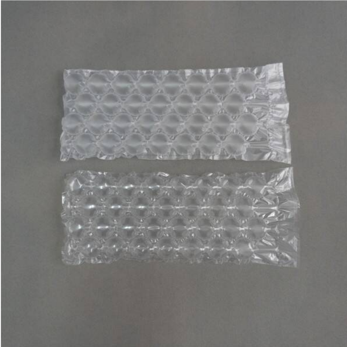
PAPE Air Bubble Pillow Film